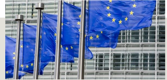
European Commission - Data strategy for European companies