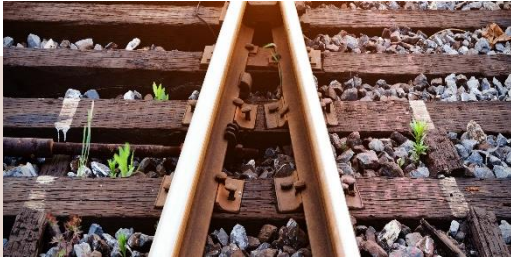
SNCF Réseau - Rail infrastructure maintenance performance