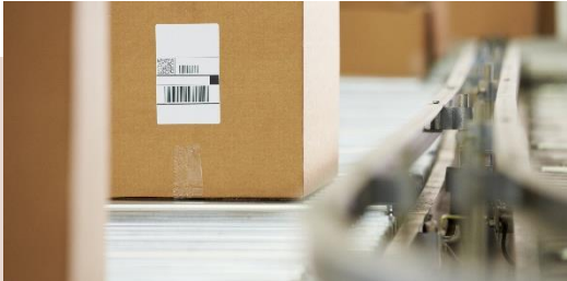
Carrefour – Supply Chain grocery e-commerce