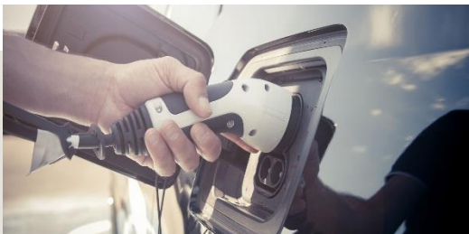
Enedis - Recharging of electric vehicles and the domestic environment