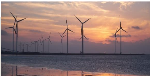
BPI France - Artificial intelligence to improve the environment