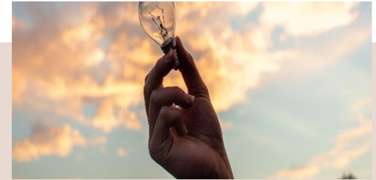
Global distributor of electrical equipment – Transformation of e-commerce channel at European level